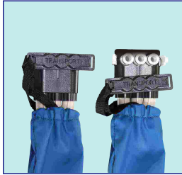
Transportation Mode The transportation cap can be used in case of patient transportation or power outage.